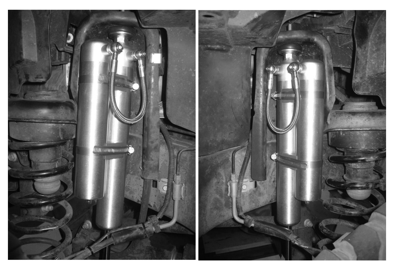
Figure 1. front driver side