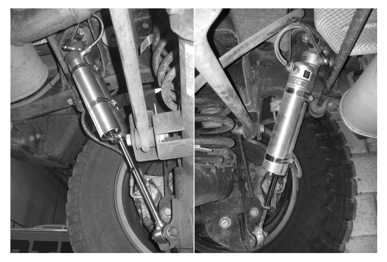
Figure 3. rear driver side