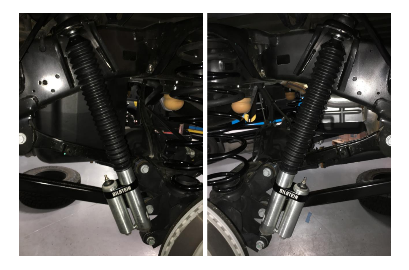
Figure 2 – LEFT REAR