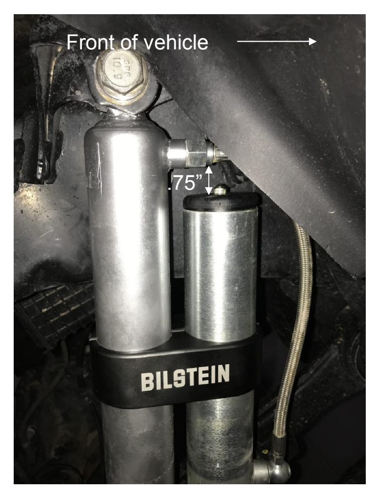
Figure 2. Rear passenger side